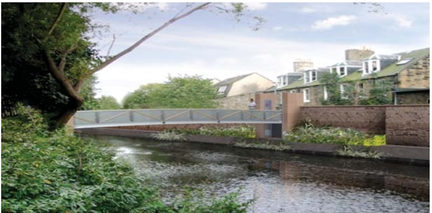
Picture of Bell Place Bridge, Water of Leith Flood Prevention Scheme

The now extensive CCM customer base ensures that their feedback results in a service that reflects their business operating needs. Key requirements are a fast startup, ease of use and simplicity – not to be confused with, or a part of, other services. We are pleased that first class project management consultants such as Arup and Turner & Townsend are extending their use of the system. We look forward to continuing partnerships with colleagues in Scotland."