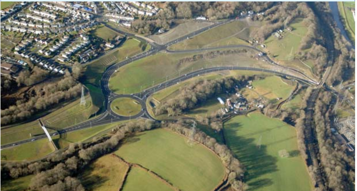
Part of the completed works at Church Village