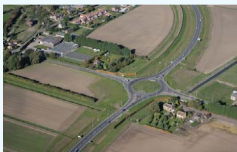
New roundabout on Moulton Chapel Road in Cowbit

and 3. CCM is currently used by an extensive range of clients around the UK, and in New Zealand, on civils, power and building projects. Key benefits include