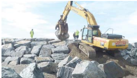
Tywyn coastal defence works

provides easy access to all those involved in the administration of the contract."